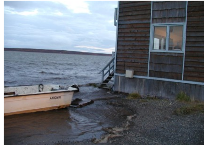
Photo 2: Kotzebue lagoon and Swan Lake merge as a large low pressure weather system over the Seward Peninsula and high tide raised water levels higher than usual on Sept. 23, 2005.